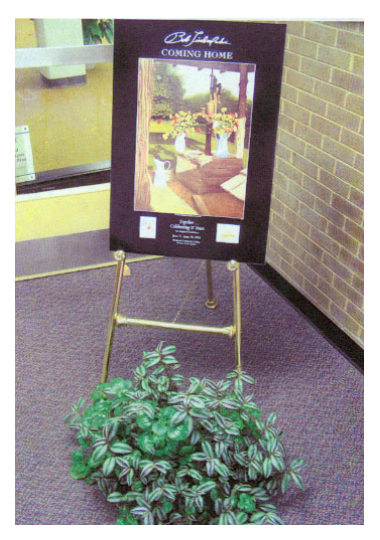
Timberlake poster on display at PCC.

Dan River Prison Work Farm continues to have one of the best Horticulture programs around at the Roxboro Satellite Training Center in Roxboro, NC. Mr. Sammy Cobb provides instruction to 22 students on a daily basis and you can always expect to find a greenhouse and facility grounds full with a variety of plants, trees and vegetables.