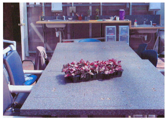
Table built by vocational students at Pender CI.

Seeing these individuals' interaction is what makes these projects truly rewarding. It is apparent the staff and inmates assigned to the vocational department are definitely focused on community involvement and assistance and meeting special needs.