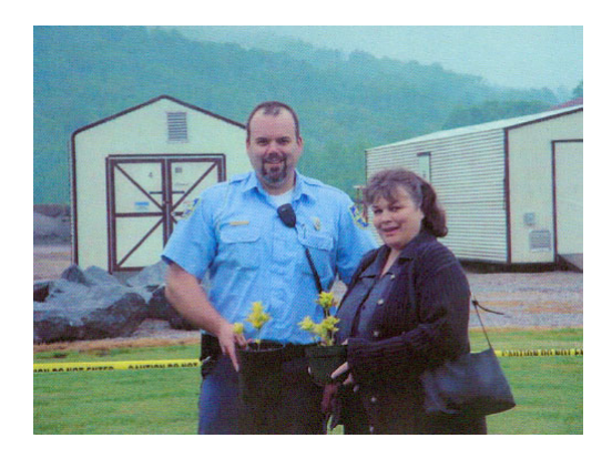
Above: Staff show support for the hard work put into the horticulture program. Below: Various plants grown at Marion CI.

The MCI Horticulture program held it's Annual Spring Plant Sale on May 5<sup>th</sup> and 6<sup>th</sup>. Although the weather was rainy and cold, the turnout was great. Approximately $2,500 in plants was purchased by McDowell Technical Community College and Marion Correctional Institution employees. The funds made from the sale are used for the purchase of seeds, potting soil, pots, etc. to support the daily operation of the program. Staff from both facilities did a tremendous job hanging tough despite the miserable weather Mother Nature threw at them.