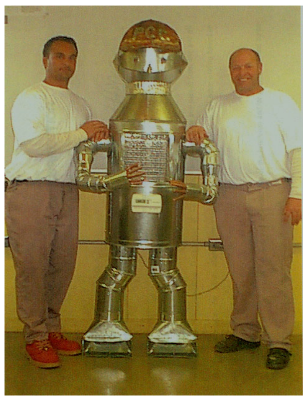
Student designers stand with finished product.

What began as an idea to put all of the aspects of HVAC work into some sort of tangible project resulted in the creation of "Cool Con" by students in Philip Poe's HVAC class at Caswell Correctional Center. This "robot" is an actual, working air conditioning system. The belt buckle is the thermostat while the glowing eyes show the transfer of refrigerant through the unit. One student was the mastermind behind the project with another helping him every step of the way. The parts came from discarded materials from water coolers and AC/window units. Furthermore, the refrigerant used in the system is the new HFC ozone friendly refrigerant as required by the EPA regulations - a very important aspect of the class, as all students are required to become EPA certified. The robot was given a creative name, "Cool Con", and without a doubt, this project is a "cool" idea that has come to life.