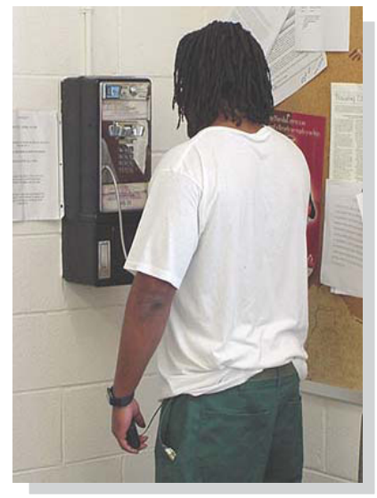
At many prisons, telephones for inmate use are available in dayrooms and common areas.

It is best to call the prison facility where the inmate is housed and speak with the case manager that is assigned to that inmate. Prison facility phone numbers are listed at the back of this book. An inmate's current location can be found by using the online offender search at www.doc.state.nc.us or by calling 1-800-368-1985.