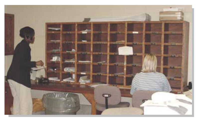
Incoming and outgoing mail is sorted and checked for contraband.

Yes. One of the most important ways to communicate with the inmate is through letters and the Division of Prisons encourages family and friends to write.