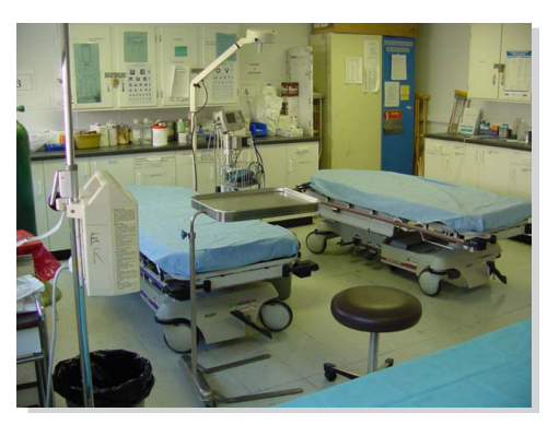
Emergency room at Central Prison's hospital

Several prisons have medical facilities on site that provide observation and care. Local community hospitals provide medical care and treatment when hospitalization is required. (For questions on visitation if the inmate is hospitalized, please see the previous section on visitation).