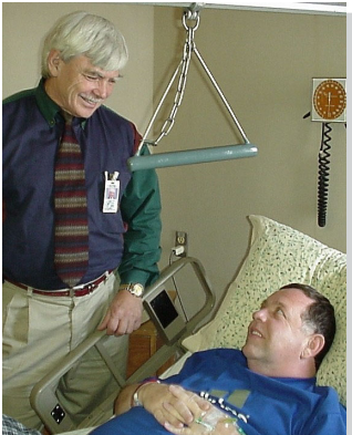
Chaplains are available at most prison facilities to lead religious services and counsel inmates

Parenting Programs – The Division of Prisons recognizes the importance of family. A number of classes are offered that assist inmates in being better parents by helping them to recognize the needs of their children, and responsibilities to them. These programs help inmates work to maintain and improve relationships with their children and family during this difficult time and upon their release.