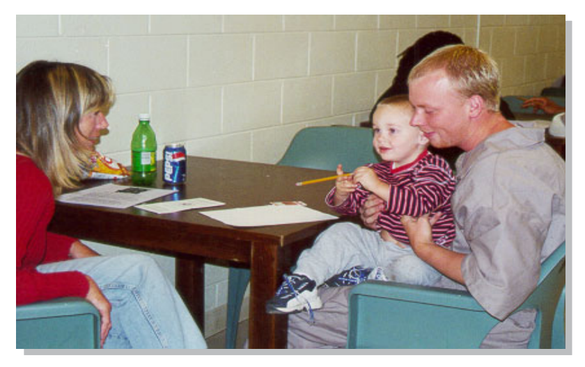
Many prisons have visiting hours on weekends for family and friends.

• Listen to a child's words and actions. If a child says they miss mom or dad, that's a good time to begin talking about their feelings. Also, if you see a change in behavior during special occasions such as Father's Day, Mother's Day, that is an opening for conversation.