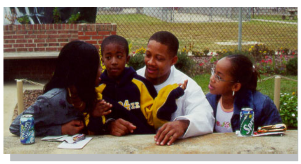
Visitation is an important way for inmates to maintain

their birth certificate with the application. Minors under 18 must be accompanied by an adult. Adults must supervise all minor children during visits.