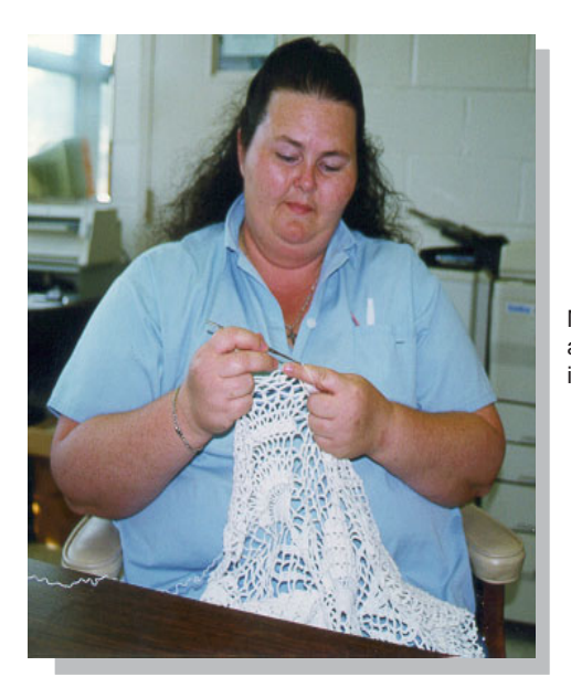
Many types of recreational activities are available to inmates.

Recreation, Arts and Crafts – Inmates are given the opportunity to participate in recreational activities as well as arts and crafts classes and contests. These activities are opportunities for improvement and are usually offered after work activities are done.