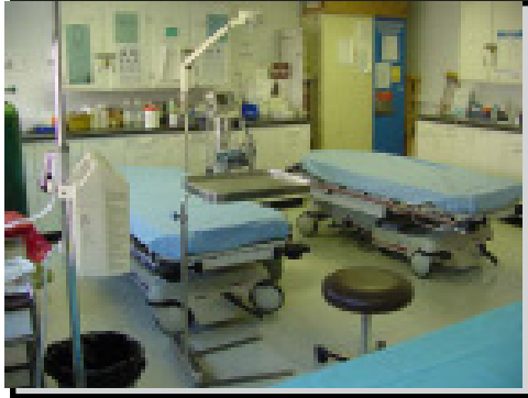
Emergency room at Central Prison's hospital

Several prisons have medical facilities on site that provide observation and care. Local community hospitals provide medical care and treatment when hospitalization is required. (For questions on visitation if the inmate is hospitalized, please see the previous section on visitation).