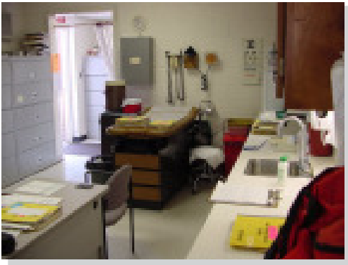
Medical treatment area at a minimum security prison

In most circumstances, the Division of Prisons is charged with ensuring that all inmates receive appropriate medical, dental, and mental health care. The Division's physicians and dentists provide medical and dental services. Inmates in minimum custody may be allowed to use their personal or family physician if the expenses are paid completely by the inmate or the inmate's family.