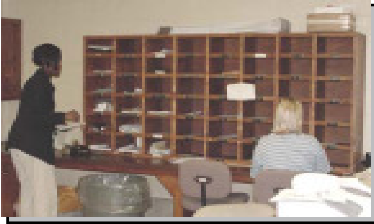
Incoming and outgoing mail is sorted and checked for contraband.

Yes. One of the most important ways to communicate with the inmate is through letters and the Division of Prisons encourages family and friends to write.