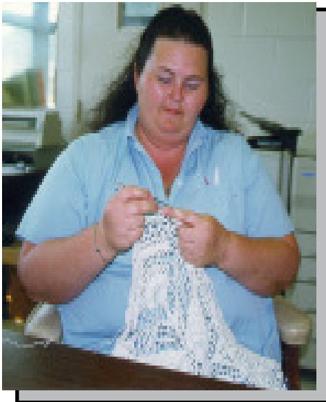
Many types of recreational activities are available to inmates.

Recreation, Arts and Crafts – Inmates are given the opportunity to participate in recreational activities as well as arts and crafts classes and contests. These activities are opportunities for improvement and are usually offered after work activities are done.