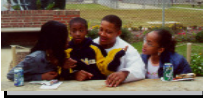
Visitation Is An Important Way To Maintain Family Contact

must be accompanied by an adult. Adults must supervise all minor children during visits.