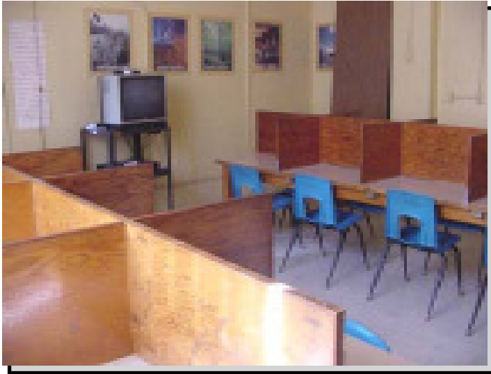
Inmates are tested at a diagnostic center to determine appropriate custody, housing and program assignments.

North Carolina Correctional Institution for Women 1034 Bragg Street 4287 MSC Raleigh, NC 27699-4287 Telephone (919) 733-4340