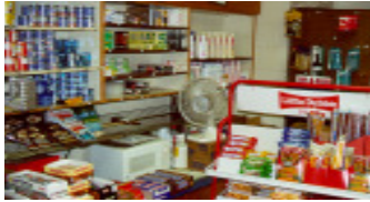
A typical prison canteen stocked with snacks and personal hygiene items

If an inmate receives a money order, cashiers check or certified check in the amount of $100 or more within 15 days prior to release, he or she will not receive the money until that money order, cashiers check or certified check has cleared the bank.