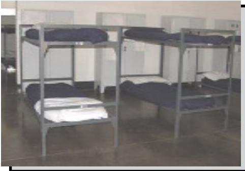
Minimum custody dormitory

Close Custody – This custody is more restrictive than medium and is for those who must be closely watched because they are an escape risk, have been convicted of very serious crimes, or their actions in prison have shown they will not follow the rules. Close custody housing is generally made up of single cells and divided into cellblocks, which may be in one building or multiple buildings. Inmates in this custody are also under constant supervision.