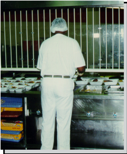
An inmate food service worker prepares meals on the serving line at Central Prison.