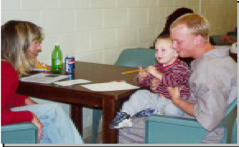
Many prisons have visiting hours on weekends for family and friends.