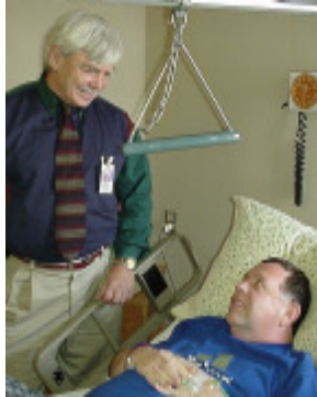
Chaplains are available at most prison facilities to lead religious services and counsel inmates

Parenting Programs – The Division of Prisons recognizes the importance of family. A number of classes are offered that assist inmates in being better parents by helping them to recognize the needs of their children, and responsibilities to them. These programs help inmates work to maintain and improve relationships with their children and family during this difficult time and upon their release.