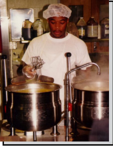
Prison meals are prepared by inmate cooks working under the supervision of correctional food service officers.