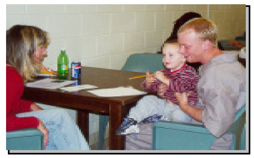
Many prisons have visiting hours on weekends for family and friends.

• Listen to a child's words and actions. If a child says they miss mom or dad, that's a good time to begin talking about their feelings. Also, if you see a change in behavior during special occasions such as Father's Day, Mother's Day, that is an opening for conversation.