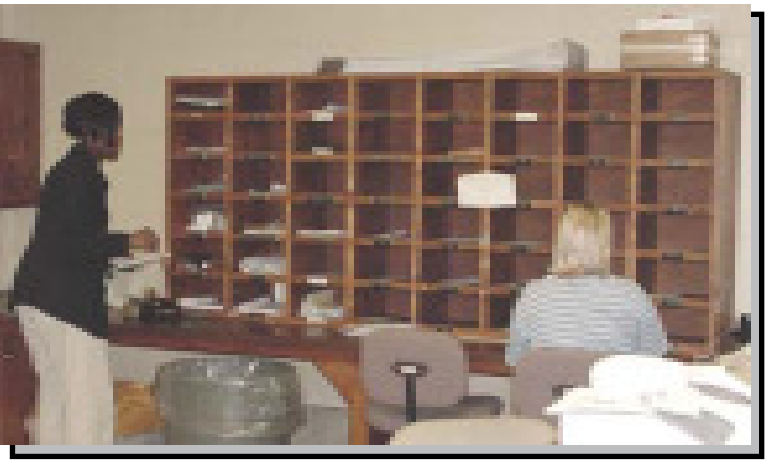
Incoming and outgoing mail is sorted and checked for contraband.

Yes. One of the most important ways to communicate with the inmate is through letters and the Division of Prisons encourages family and friends to write.