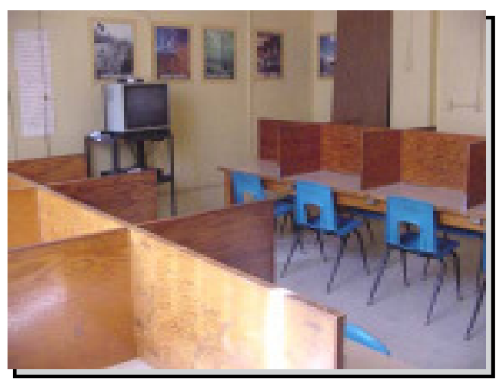
Inmates are tested at a diagnostic center to determine appropriate custody, housing and program assignments.

North Carolina Correctional Institution for Women 1034 Bragg Street 4287 MSC Raleigh, NC 27699-4287 Telephone (919) 733-4340