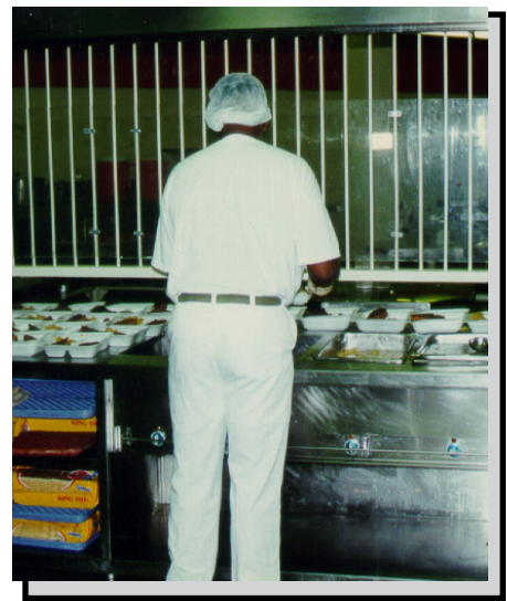
An inmate food service worker prepares meals on the serving line at Central Prison.