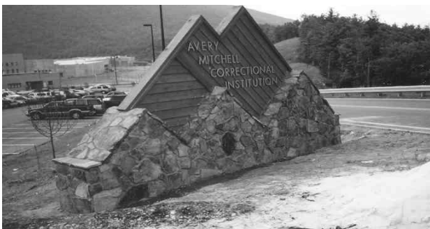
Masonry students from Buncombe Correctional Center constructed the main entrance sign to Avery Mitchell Correctional Institution as a hands-on class project in July 2000.