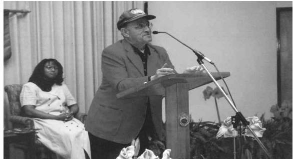
George L. Shade, one of the original Tuskegee Airman of World War II fame, addresses students at Foothills Correctional Institution during Black History month 2000.