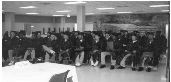
Graduation Day 2000 at Pasquotank Correctional Institution.