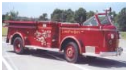
1947 American LaFrance

Ten Community Corrections employees in judicial district 9B, which handles Warren County, will work out of the center. Located on Highway 58 just east of Warrenton, the center's official address is 132 Rafters Lane, Suite 101, Warrenton, NC 27589. The telephone number for the DCC office remains the same-- (252) 257-1309.