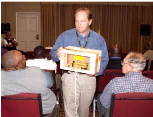
In the "Terrorism in Prison" workshop, a Cumberland County Sheriff Department lieutenant shows a now-harmless dynamite letter bomb that was sent to a judge.