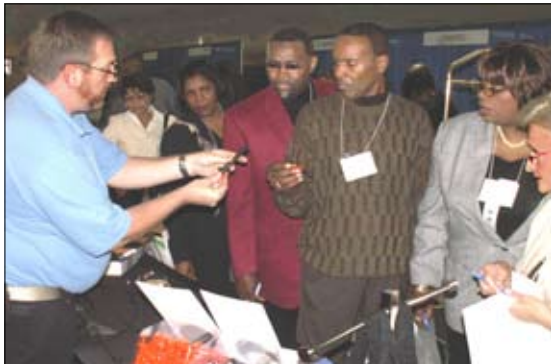
A gun care vendor explains one of his products to conference attendees.